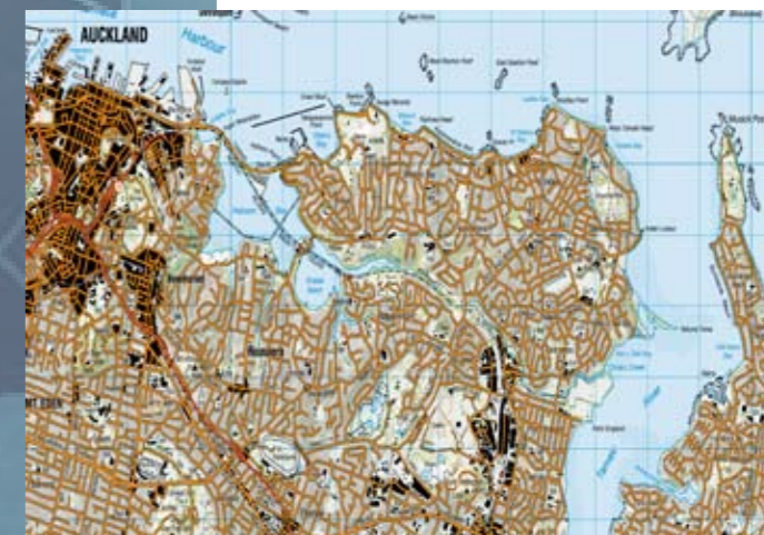
Figure 4 - After