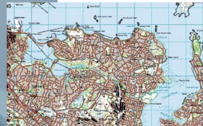
Figure 3 - Before

Contact us to find out more about the solutions 1Spatial can provide for you: email info@1spatial.com or call us on +44 (0)1223 420 414